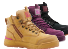
Women's 3056 PAGE 77 Y60240, Y60245, Y60250