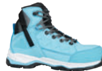
Atomic PAGE 69 Y60173