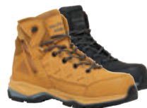
Atomic PAGE 67 Y60280, Y60285