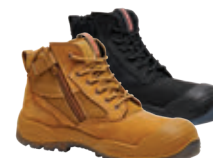
Nite Vision PAGE 85 Y60230, Y60235