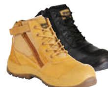
Utility 5Z PAGE 83 Y60120, Y60125