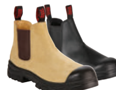
Grit Gusset PAGE 87 Y60087, Y60088