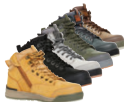
3056 PAGE 75 Y60200, Y60201, Y60202, Y60203, Y60204, Y60205