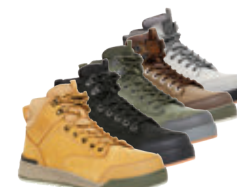
3056 NS PAGE 79 Y60131, Y60132, Y60133, Y60134, Y60136