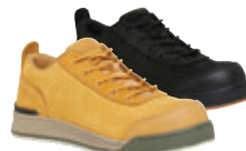
3056 Lo PAGE 81 Y60113, Y60114