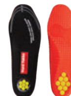
ERP FOOTBED PAGE 88 Y60178