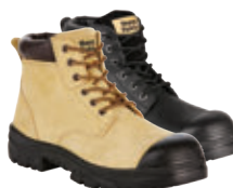
Gravel PAGE 86 Y60085, Y60086