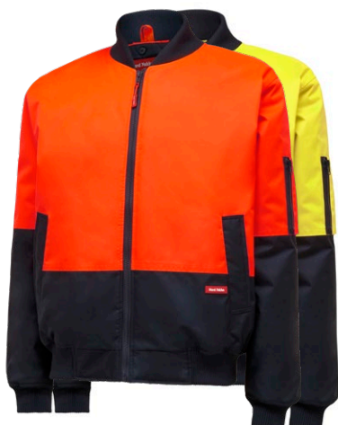
Y06670 HARD YAKKA HI VIS 2TONE BOMBER JACKET SIZE S-5XL

COLOUR Orange/Navy (ONA), Yellow/Navy (YNA)