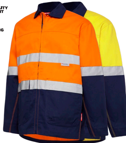
Y06545 HI-VISIBILITY TWO TONE COTTON DRILL WORK JACKET WITH TAPE SIZE S-4XL

COLOUR Orange/Navy (ONA), Yellow/Navy (YNA)