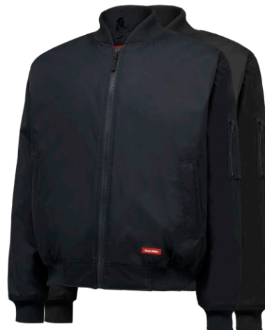
Y06680 HARD YAKKA BOMBER JACKET SIZE S-5XL