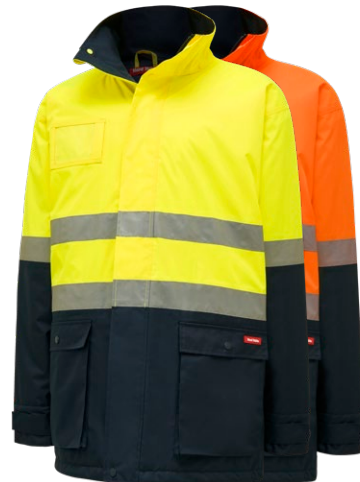
Y06685 HARD YAKKA HI VIS 2TONE QUILTED JACKET WITH TAPE SIZE S-5XL

COLOUR Yellow/Navy (YNA), Orange/Navy (ONA)