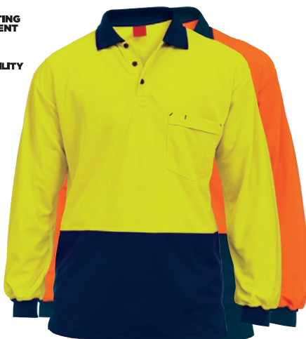
Y19610 HI VIS 2 TONE L/SL MICRO MESH POLO SIZE S-5XL

COLOUR Yellow/Navy (YNA), Orange/Navy (ONA)