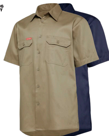
Y04625 S/SL L/WEIGHT DRILL VENTILATED SHIRT SIZE S-5XL