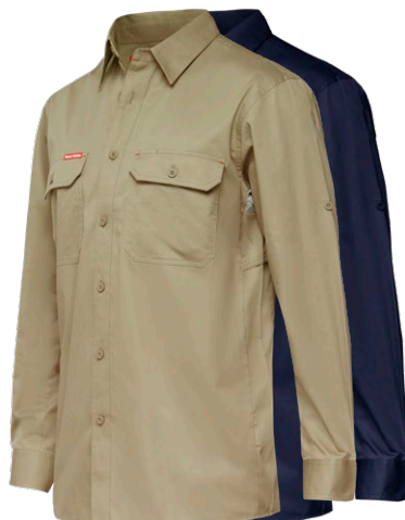
Y04630 L/SL L/WEIGHT DRILL VENTILATED SHIRT SIZE S-5XL