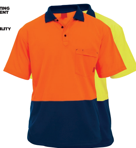
Y19605 HI VIS 2 TONE S/SL MICRO MESH POLO SIZE S-5XL

COLOUR Orange/Navy (ONA), Yellow/Navy (YNA)