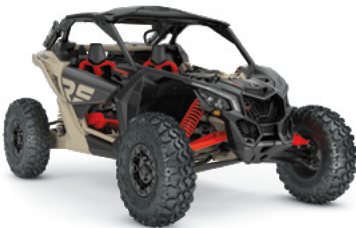
X rs ● Turbo RR ● Turbo RR ● Turbo RR