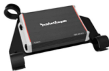
CAN-AM AMPLIFIER KIT X3 715007227