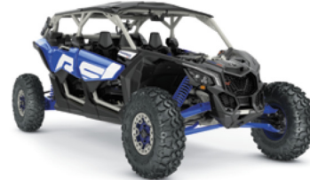
X rs ● Turbo RR ● Turbo RR ● Turbo RR