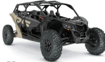
RS ● Turbo RR ● Turbo RR ● Turbo RR