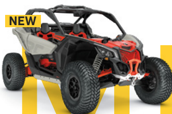
NEW X rc 64" ● Turbo RR