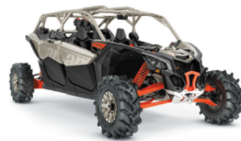
X mr ● Turbo RR

THIS LINEUP IS WIDE OPEN AND THERE FOR THE TAKING.