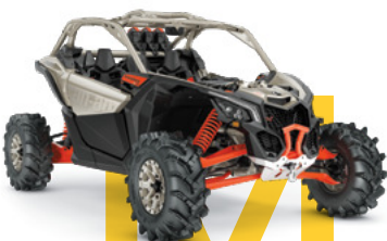
X mr 72" ● Turbo RR