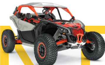
X rc 72" ● Turbo RR