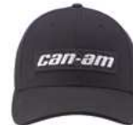
CURVED CAP PATCH Available in Black & Navy 454433