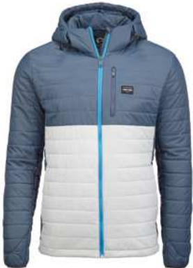
VECTOR INSULATOR PUFFER JACKET Available in Black & Blue 454436

T-SHIRTS, SWEATERS, CAPS, JACKETS AND MORE. GET THE BEST CAN-AM APPAREL FOR LIVING YOUR BEST OFF-ROAD LIFE.