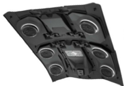
CAN-AM AUDIO ROOF MAX X3 715006709