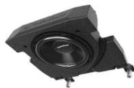
CAN-AM SUBWOOFER X3 715004956 MTS 715006359