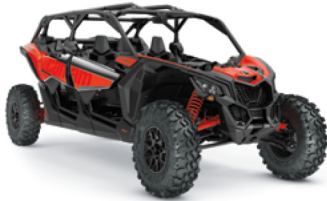
DS ● Turbo Turbo RR ● Turbo Turbo RR ● Turbo Turbo RR