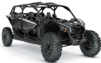
X ds ● Turbo RR ● Turbo RR