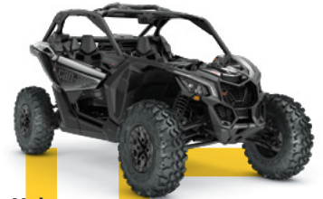
X ds ● Turbo RR ● Turbo RR