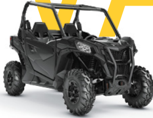
DPS ● 700 1000 ● 1000 ● 1000

With speed, power and performance beyond your wildest dreams, our 2022 Off-Road Lineup is over-eager and adventure-ready. Loaded with huge power and industry-leading technology and design, these machines are built to last, blast and make your heart beat fast.