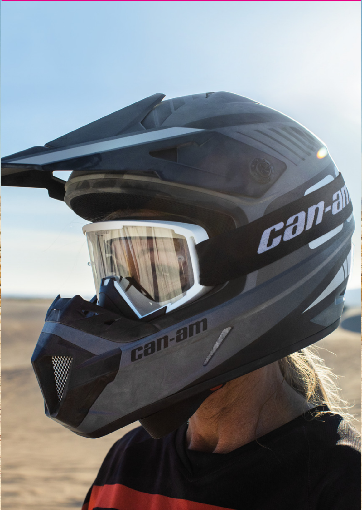
CORRY WELLER CAN-AM PRO RIDER