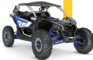
X rs with Smart-Shox ● Turbo RR ● Turbo RR ● Turbo RR