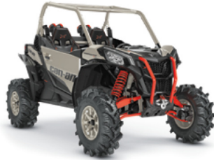
X mr ● 1000R