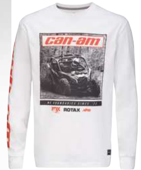
SANDER LONG-SLEEVE T-SHIRT Available in Blue & White 454477