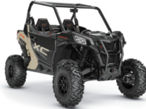
X xc ● 1000R