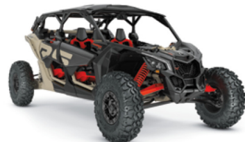
X rs with Smart-Shox ● Turbo RR ● Turbo RR ● Turbo RR