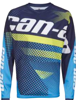
① X-FACTOR JERSEY Available in Blue, Grey & Yellow 454437

Available in Black, Blue, Pink & Red 446329