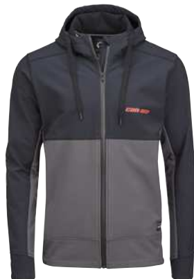
BLOCKADE SOFTSHELL Available in Black & Blue 454442