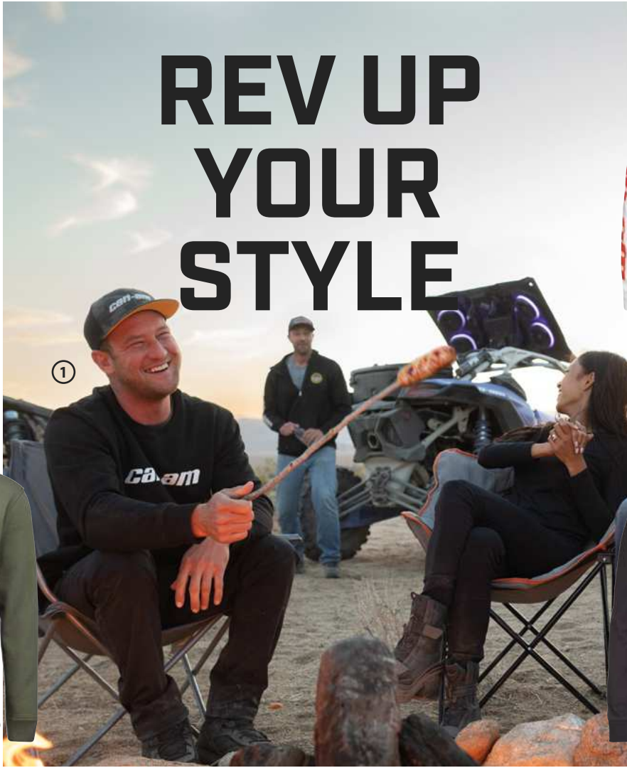
① CAN-AM SIGNATURE CREW FLEECE Available in Black & Heather Grey 454474