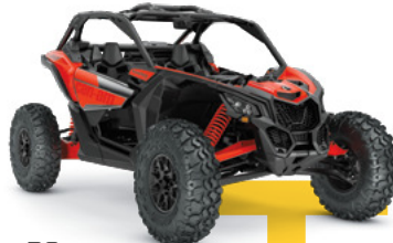
RS ● Turbo RR ● Turbo RR ● Turbo RR