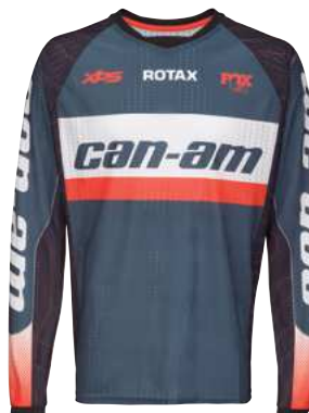
ZULU JERSEY Available in Black & Blue 454426