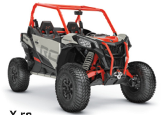
X rc ● 1000R