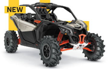
NEW X mr 64" ● Turbo RR