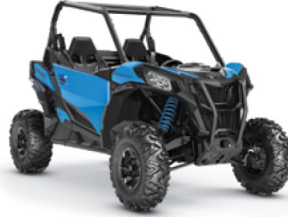
DPS ● 1000R ● 1000R