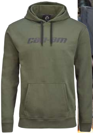
CAN-AM SIGNATURE PULLOVER HOODIE Available in Army Green & Heather Charcoal 454516