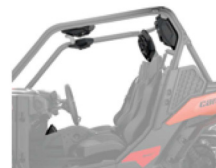
COMPLETE WET SOUNDS AUDIO SYSTEM MTS 715003672