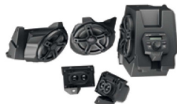
COMPLETE MTX AUDIO SYSTEM X3 715002873