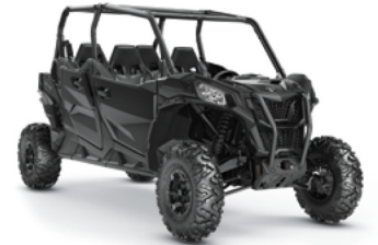
MAX DPS ● 1000R