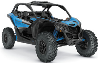
DS ● Turbo Turbo RR ● Turbo Turbo RR ● Turbo Turbo RR