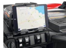
ELECTRONIC DEVICE HOLDER X3 715002874 MTS 715005212