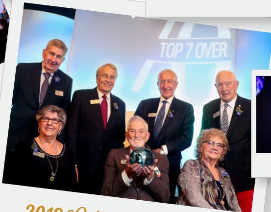
2019 Gala Award Recipients