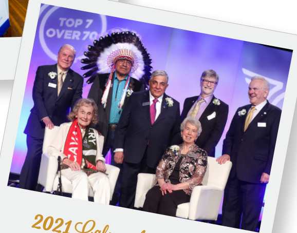
2021 Gala Award Recipients