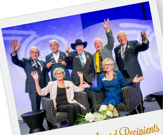
2023 Gala Award Recipients