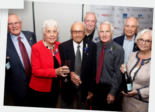
2017 Gala Award Recipients